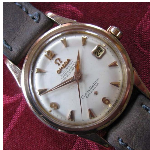
Rose Gold Capped 503 with uncommon original dial, waiting for the sourcing of a correct crown. My collection.

When you add attrition, such as removal of movements to collect gold scrap (This happened a lot during the demonetisation of gold and the floating of the gold price in the late 1960s to early 1970s, where the price rose from US$40 an ounce to US$180.00 in 1974 and its happening now with the current overly-inflated gold price); neglect and wear; loss ; abandonment during the quartz fad in the later 1970s, etc., it is not fanciful to describe any member of the calibre 504 family as uncommon bordering on rare, particularly the less common arrowhead markers dials.