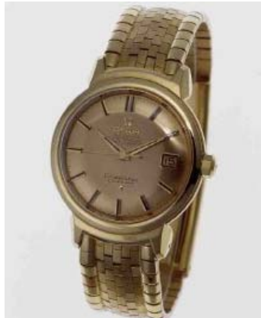
OT 16995 Grand Luxe with onyx inlaid baguette markers

The Omega database shows in its index a total of four model numbers having been produced in 1957 and 1958. These models were on the market for a total of two years. Model 2943 was also produced in 14K yellow and pink gold cap on stainless steel, 14K solid gold and 18K solid gold. Model 16995 came in solid yellow gold and, possibly white gold, with integrated bracelet, while model 2988 was available with leather strap. Model 2954 was also exclusively solid gold.